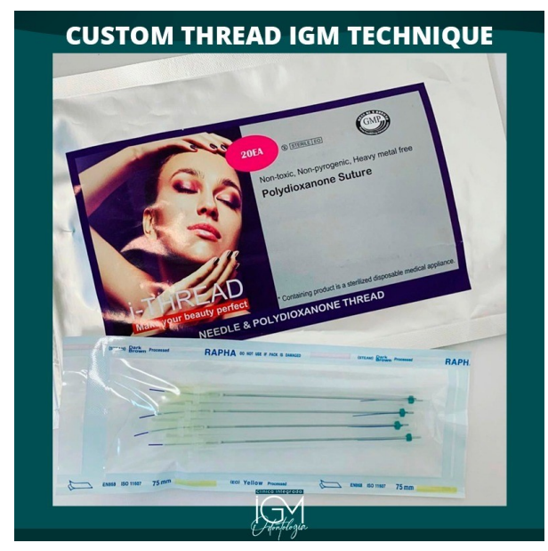
Figure 6. Selected DO support wire.

the needle in a spiral form; (d) Double screw threads consist of two strands twisted together and wrapped around a needle in spiral shapes. Their special feature is to provide spiral stability when inserted into the skin. These threads are more traumatizing, but they trigger neocolagenesis more effectively; (e) Coq or barbed threads are thicker strands, formed with lasercut barbs that allow moving soft tissues of the body and face in any direction. Barbed threads are used to stretch the eyebrows, neck, and facial contour, model facial bones, correct double chin, rebuild body soft tissues, and model new shapes and volumes. After the threads are inserted into the skin, there is an immediate lifting effect.