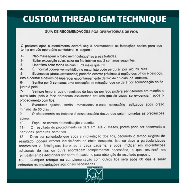
Figure 9. Postoperative guidance guide.