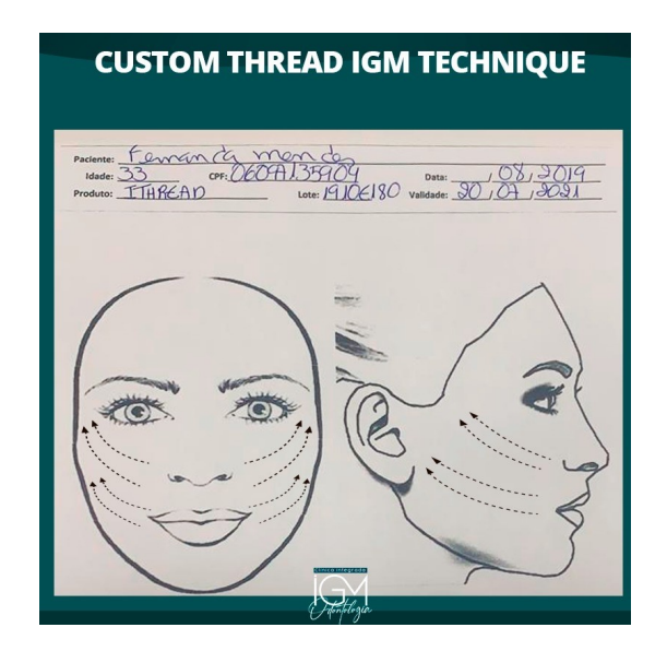
Figure 4. Planning template with PDB precurved yarn technique.

for minimally invasive procedures have led to new treatment methods for skin rejuvenation and tissue repositioning by using polydioxanone support threads (PDO). This method prevents ptosis from facial soft tissue, complemented by harmonious aesthetic techniques available.