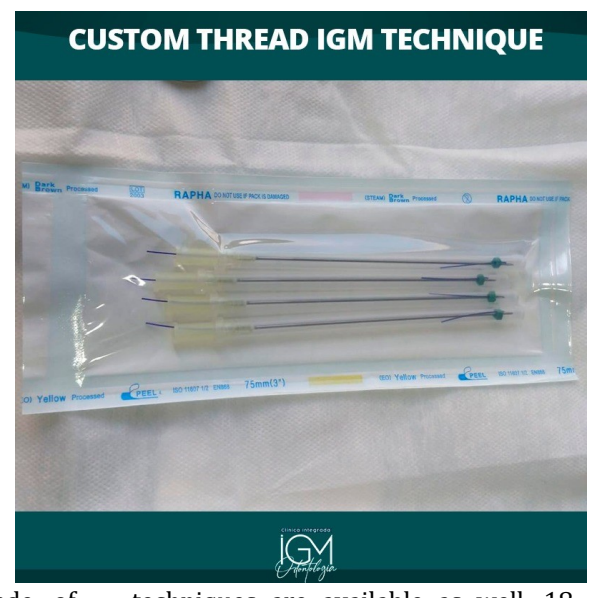
Figure 7. PDO support wire before pre-bending.

Currently, there are several techniques for using the support threads through intramuscular or intradermal and subcutaneous injections, such as the linear vector technique, shielding technique, and sandwich technique. In addition, suture technique, fanning technique and a combination of all these