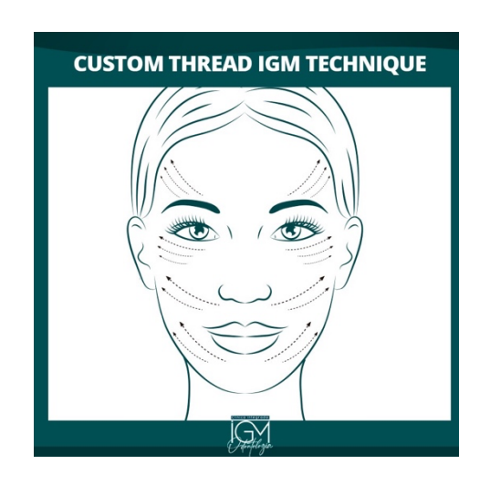
Figure 2. Custom Thread IGM Technique.

a mirror that reflects aging of the whole body. In this process, aging affects all facial layers, skin, subcutaneous fat, ligaments, neurofacial muscles, bone structure, and superficial muscular aponeurotic system (SMAS). Innovative procedures for facial rejuvenation have been created in recent years, using surgical and non-surgical techniques.<sup>5</sup>