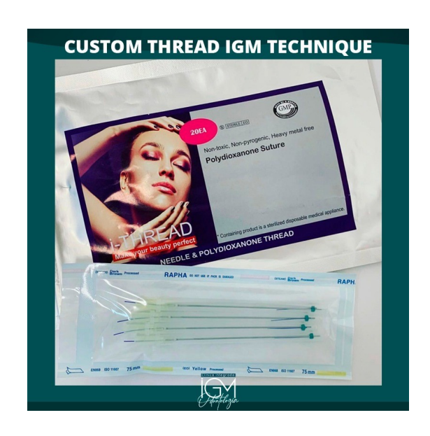
Figure 3. Selection of DPO support wire.

For many years, ptosis correction was performed exclusively through surgical procedures. Latest technology advancements and increasing demand