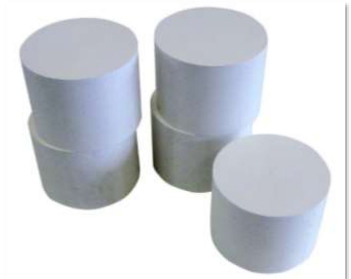
Fig 3b. BioHPP Prefabricated Cylinders

operation with Jena University (Outpatient Department for Dental Prosthetics and Materials) and Regensburg University (Specialist field of Dental Prosthetics). 6