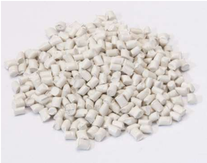
Fig 3a. BioHPP granulate material