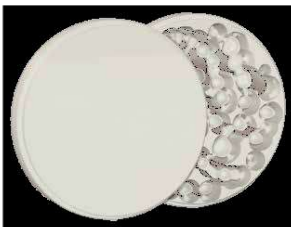
Fig 4. breCAM.BioHPP in round blank

BioHPP overcomes these disadvantages and has been proven to be a successful alternative for the fabrication of RPD frameworks. BioHPP is as elastic as bone with an elastic modulus of 4GPa thereby reducing the stress on the abutment teeth. Also, the white colour of the material gives an aesthetic appearance. Clasps made up of BioHPP are gentler on the enamel and the porcelain restorations as compared to the conventional Co-Cr clasps. Also, the periodontal health of the abutment teeth is maintained due to its low plaque affinity. According to Tannous et al, PEEK clasps offer a lower retentive force than metal clasps; however, properly designed PEEK clasps with an undercut of 0.5 mm could provide adequate retention for clinical use. 8 The bond strength of BioHPP with PMMA and indirect composite materials is high with the use of a PMMA and composite primer (visio.link; Bredent GmbH & Co. KG). 9 Therefore a prosthesis with a framework of BioHPP can be easily