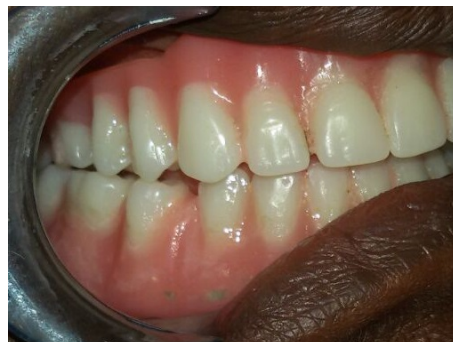
Figure 3. Right lateral view.

Fresh primary impressions of the upper and lower arches were made using impression compound (Y-Dent, MDM Corporation, Delhi), which were poured using dental stone (Kalstone, Kalabhai Karson, Maharashtra). Special trays were fabricated using self cure