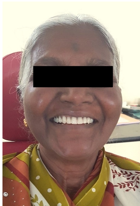
Figure 10. Final aesthetic outcome.

Melanin is the pigment found in the skin of all humans except for when it is pathologically absent. Melanin pigmentation of the intraoral tissues is a relatively frequent finding. And it is observed to be highest at the incisors 8 . Melanin is a complex organic dye which is a product of cell activity and the colour of which varies from bright red and reddish yellow through light and dark brown to black 9 . Gingival pigmentation shade is found to be deeper in Negroes and dark skinned caucasians. Replicating this natural colour in the prosthesis becomes difficult at times when the patient insists. One of the surgical treatment options is gingival depigmentation surgery which all the