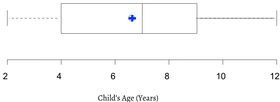
Figure 2. Boxplot of children's age in the sample.

The caries experience of children in the sample was evaluated by CPO-D and ceo-d indexes, according to their age's appliance. Because of these indexes originated from the count data, the distributions tend to be asymmetric with right tail. For this reason, although it is usually common reported the average of these indexes; it has to be cautious on using only these central tendency measure to describe a sample of these indexes measure.