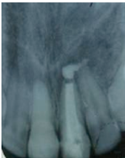
Figure 3. Radiographic evaluation at 3 months showing healing of periapical lesion.