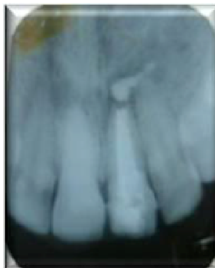
Figure 5. Radiographic evaluation showed healing of periapical lesion after 9 months.