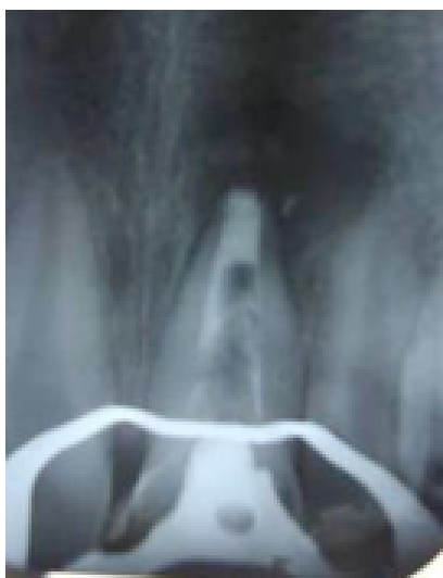
Figure 9. Apical plugging done with Mineral Trioxide Aggregate.