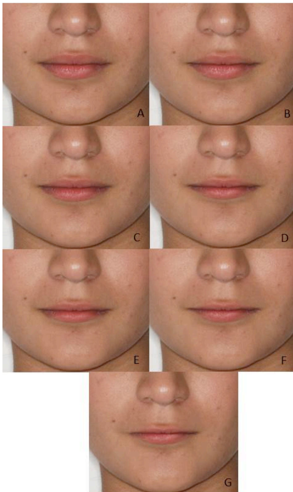
Figure 1. Series of 7 images used in the research, with A: Original; B: -0.5 mm; C: -1.0 mm; D: -1.5 mm; E: -2.0 mm; F: -2.5 mm and G: -3.0 mm, individually presented to lay examiners following the A - G sequence for the assignment of scores from 0 (not very attractive) to 10 (very attractive) according to the scale above.

characterized by vermillion heights of 0 mm to -2 mm (Figure 1).